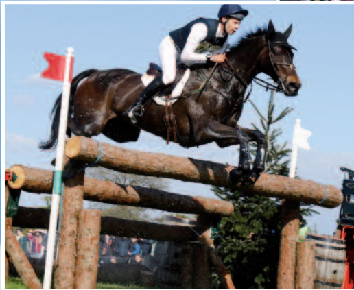
Above: COOLEY LANDS (Placed 3rd Badminton CCI5*L 2019)