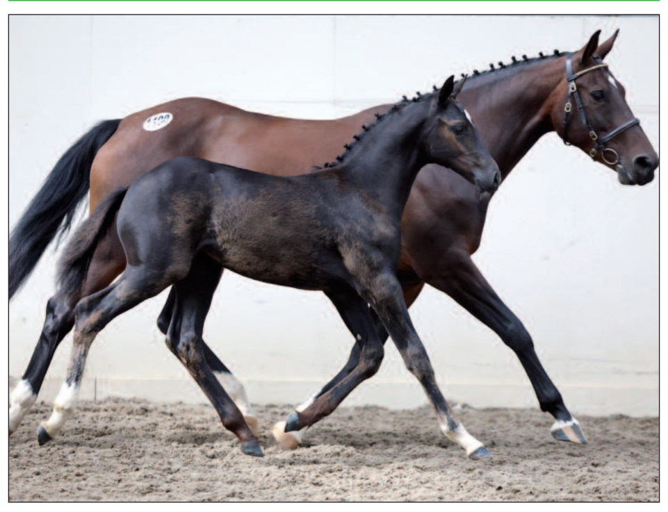
LOT 2: BALLYV-ANNIE, black filly, 27/04/2023 Property of Ballyvarogue Stables Ltd