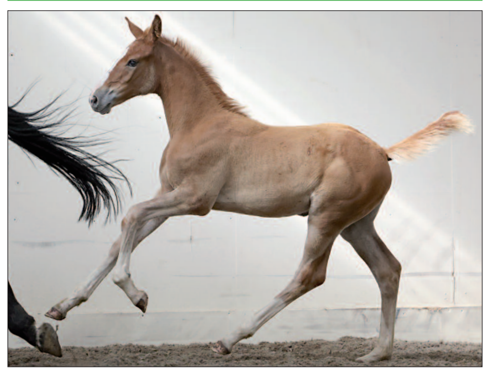
LOT 10: UNNAMED, chestnut filly, 29/04/2023 Property of Caroline Fleming