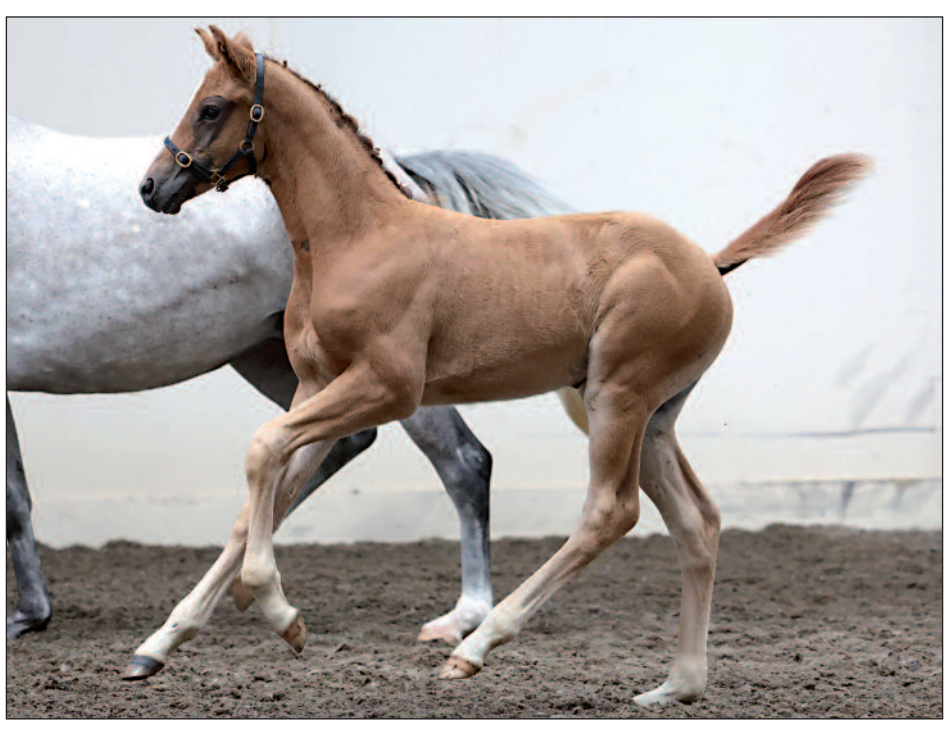
LOT 4: CATCHING FIRE RF, chestnut filly, 26/05/2023 Property of Anna Bobel