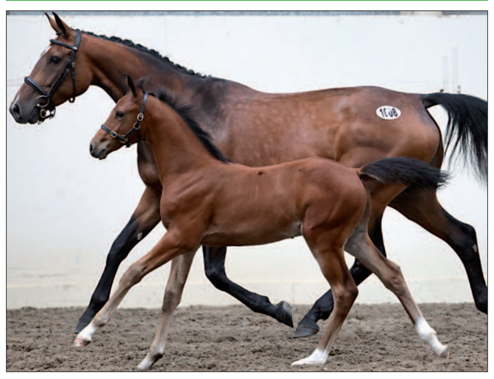
LOT 9: UNNAMED, bay colt, 19/05/2023 Property of David Lynch