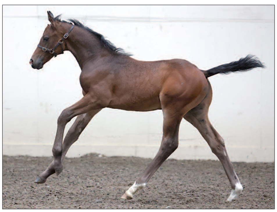
LOT 3: UNNAMED, bay colt, 29/05/2023 Property of Sharon Fitzpatrick