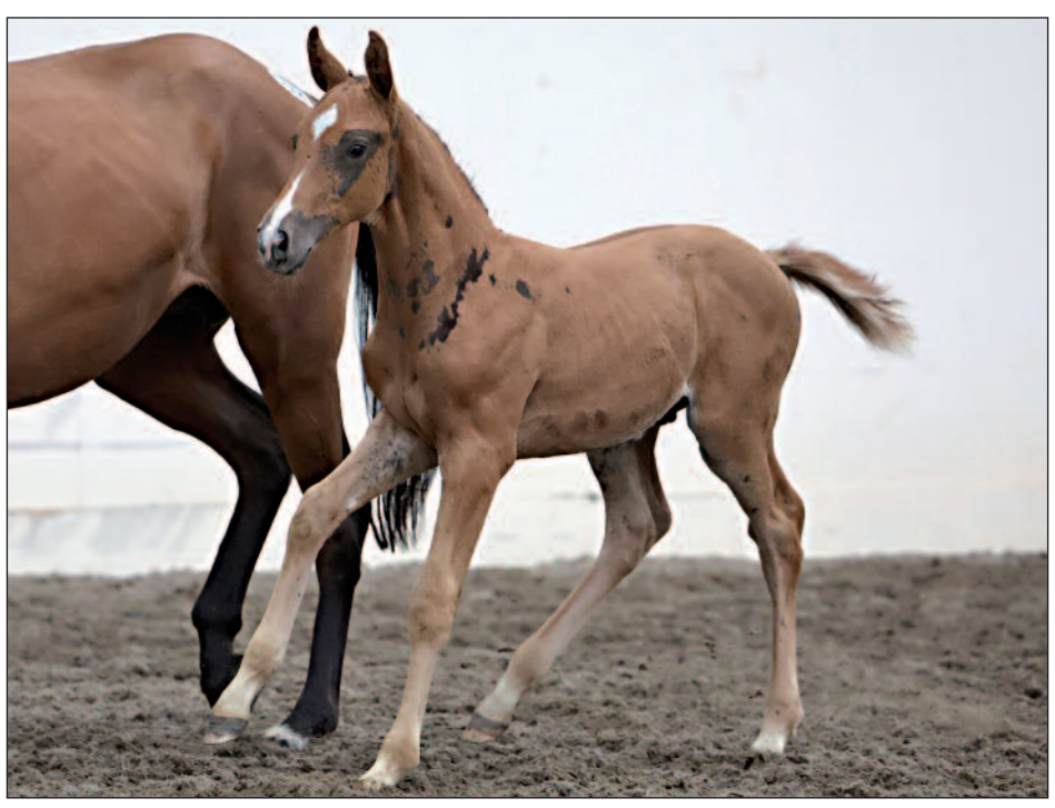
LOT 14: CBI ORLANDO, chestnut colt, 27/05/2023 Property of Carroll Brothers