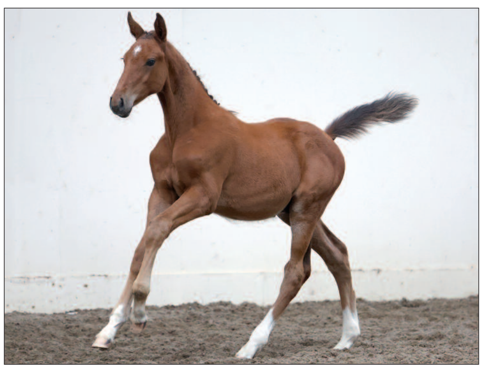
LOT 13: CORNASCRIEBE FOR EMERALD, bay colt, 02/05/2023 Property of Carol Armstrong