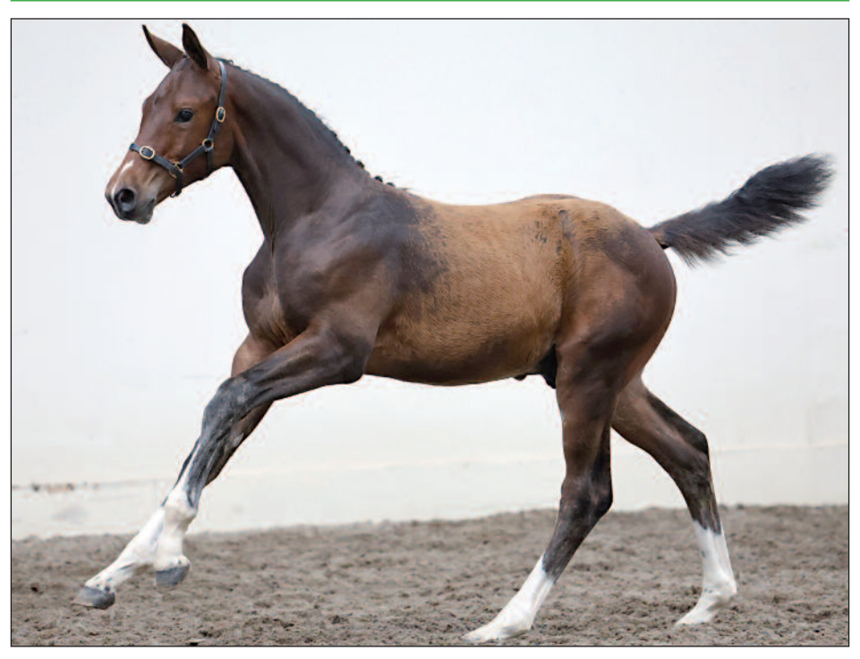
LOT 1: CSF HARRISON, bay colt, 17/04/2023 Property of Connolly Stud Farm