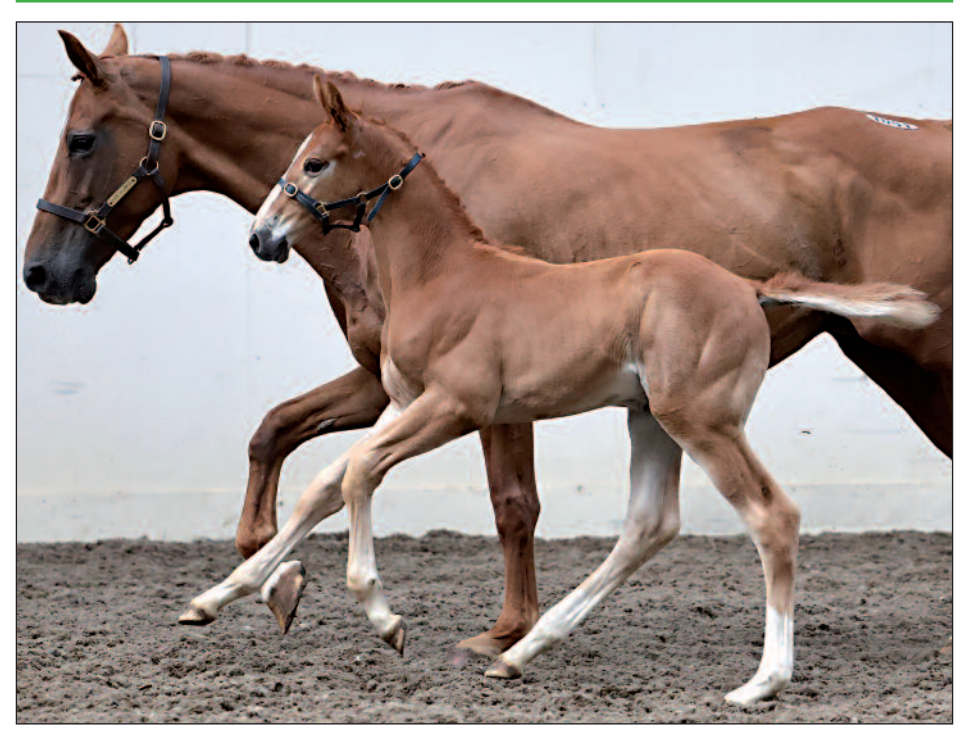
LOT 11: UNNAMED, chestnut colt, 22/06/2023 Property of Bryan Gee