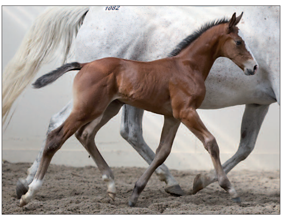
LOT 6: UNNAMED, bay colt, July 2023 Property of Molly Hughes Bravo