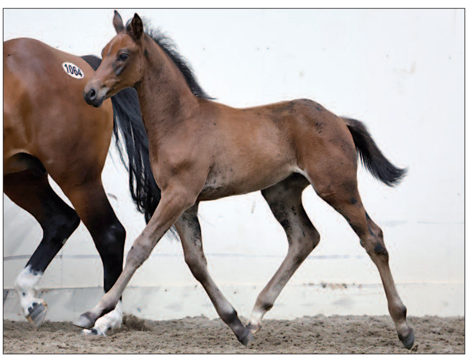
LOT 8: UNNAMED, brown colt, 08/06/2023 Property of Greenacres Stud