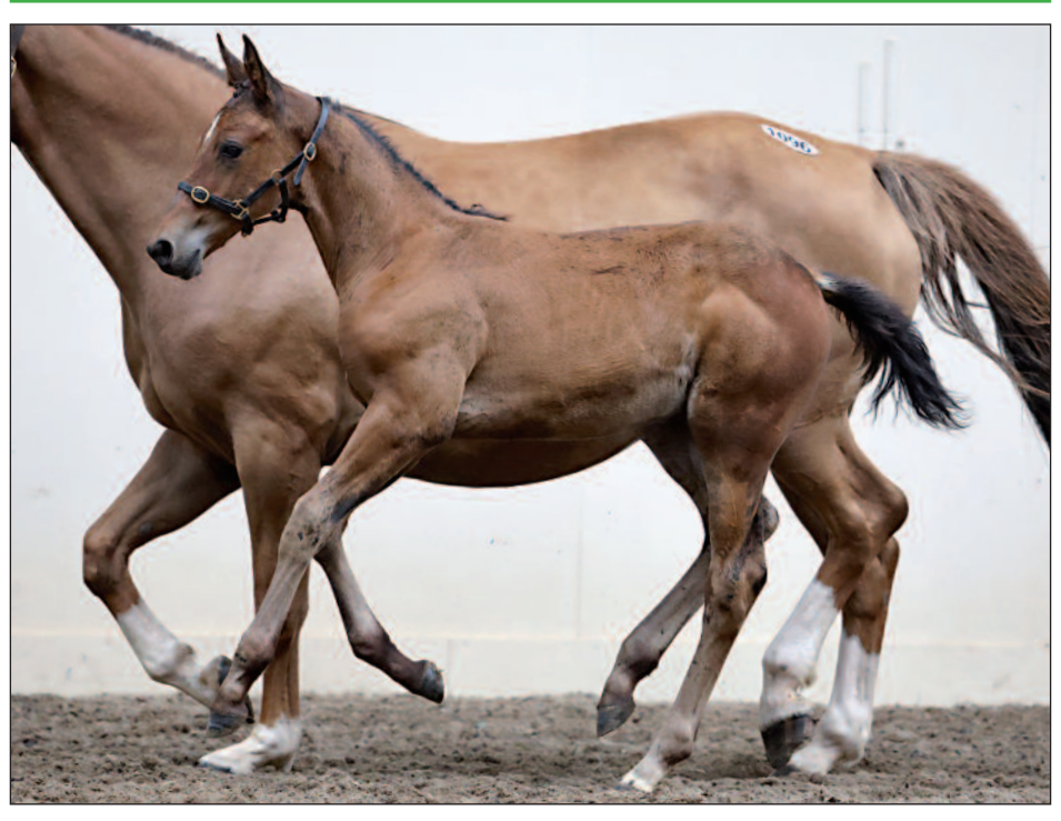
LOT 7: UNNAMED, bay colt, 15/05/2023 Property of Bryan Gee