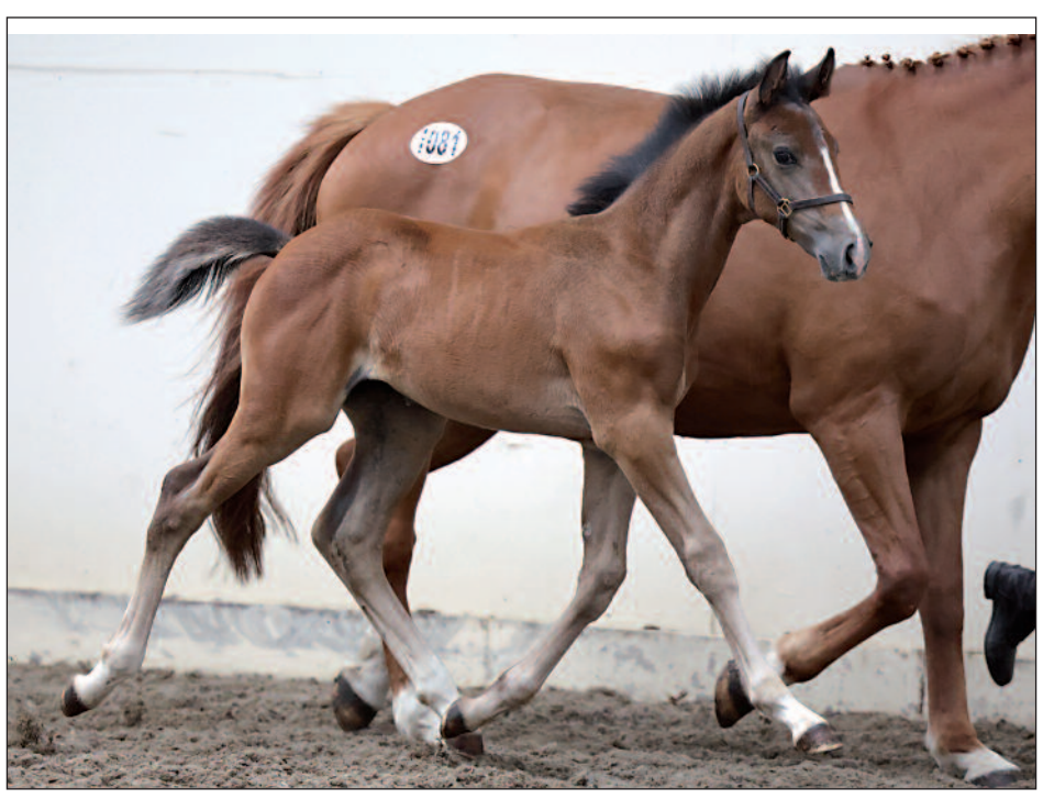
LOT 5: LINKARDSTOWN POPPY SITTE, bay/grey filly, 23/05/2023 Property of Catherine Curran