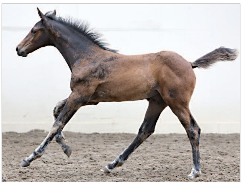
LOT 12: COOKSTOWN MAGNETIC, bay colt, 24/05/2023 Property of Donal Callery